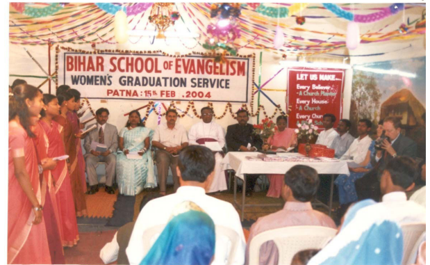
Women's Graduation Ceremony at the Bihar School of Evangelism

To support the work of BORN — send your donation to PFF, 7132 Portland Avenue Suite 136, Richfield, MN 55423. Clearly indicate BORN and the specific project (or "as most needed").